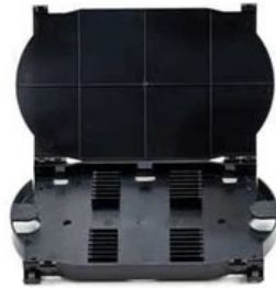
Splice Tray (S-TR24)