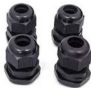
Cable Glands (M20)