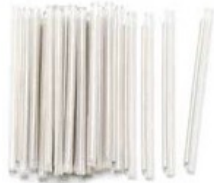
Splice Sleeves (FSLEEVE060)