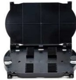
Splice Tray (S-TR24)