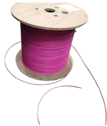
Multimode OM4 Indoor 2-12 Fiber Cable Assembly showing LC Connectors and Pull Sheath

RLH Indoor/Outdoor cable assemblies are pre-terminated with LC, SC or ST connectors, and can be ordered in any length required. Cable assemblies include a pull sheath for ease of deployment on site. Each assembly is fully tested and includes a certification test report.